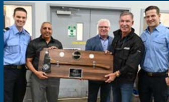
Poco Firefighters Breakfast Program for local elementary schools

Making a positive impact in the communities where we work.