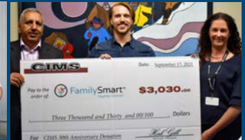
Family Smart - supporting Kids' Mental Health