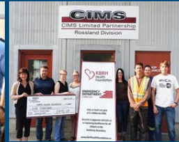
Kootenay Boundary Regional Hospital